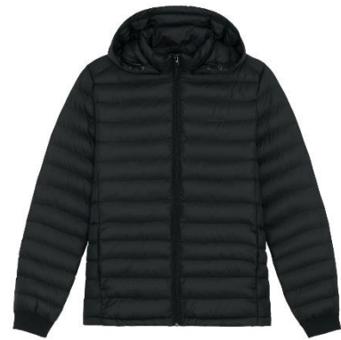
Stanley & Stella STANLEY VOYAGER Herren