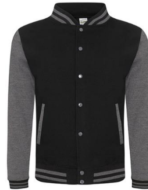
Just Hoods by AWDIs Collegejacke Unisex