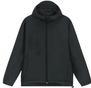
Stanley & Stella COMMUTER Unisex