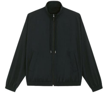
Stanley & Stella TRACKER Unisex