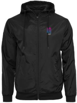
XOOSE Regenjacke Unisex