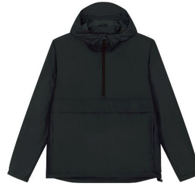
Stanley & Stella SPEEDER Unisex