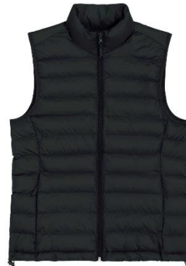
Stanley & Stella STANLEY CLIMBER Herren