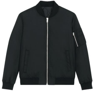
Stanley & Stella BOMBER Unisex