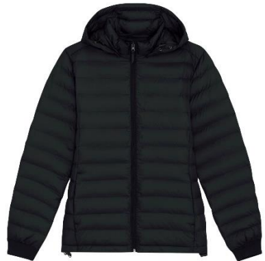
Stanley & Stella STELLA VOYAGER Damen