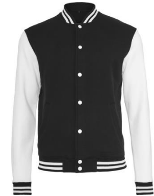
BUILD YOUR BRAND Sweat College Jacket Unisex