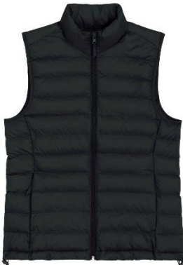
Stanley & Stella STELLA CLIMBER Damen